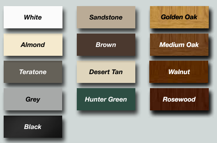
All colors shown as accurately as printing technology allows.